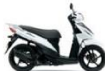
Brilliant White (76C)

Images shown in this catalogue contain computer-generated composites. Specifications, appearance, colors (including body colors), equipment, materials and other aspects of the "SUZUKI" products shown in this catalogue are subject to change by Suzuki at any time without notice, and they may vary depending on local conditions or requirements. Some models are not available in some regions. Each model may be discontinued without notice. Please inquire at your local dealer for details of any such changes.