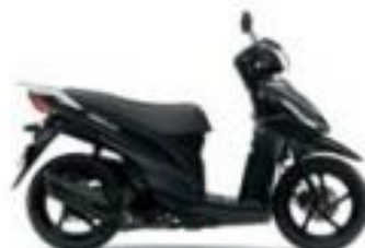
Matte Black (76B)