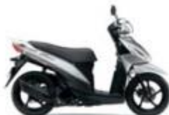
Metallic Ice Silver (76A)