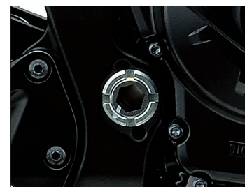
Swing Arm Pivot