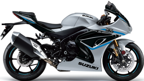
Metallic Mat Sword Silver (QKA)