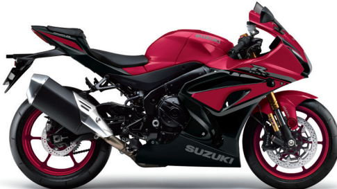
Candy Daring Red / Glass Sparkle Black (AV4)