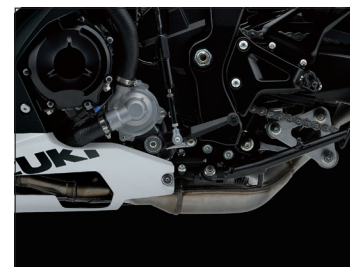
Bi-directional Quick Shift System