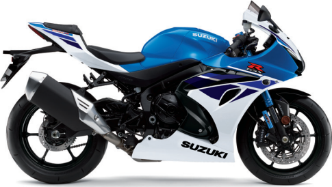
Pearl Brilliant White / Metallic Triton Blue (BQJ)

Own the Racetrack is more than just a slogan for the GSX-R1000R. It is a phrase earned by sustained success in the FIM Endurance World Championship (EWC) besting all other participating manufactures with 20 titles in the fabled series. The controllability, reliability, and durability of Suzuki's King of Sportsbikes truly demonstrates total performance integrated at the highest level.