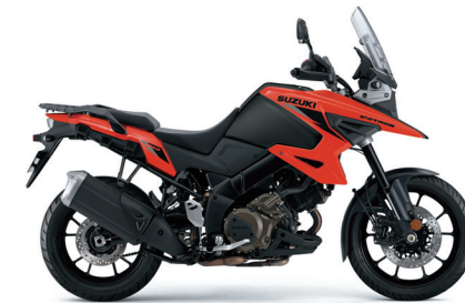
Glass Blaze Orange / Metallic Mat Black No.2 (CGH)