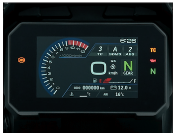
Colour Multi-information Instrument Cluster

can be raised 20mm using a height riser stored beneath the pillion seat. Both rider and pillion seat are independently designed to provide comfortable firmness for less fatigue on long rides.