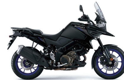
Glass Sparkle Black / Metallic Mat Black No.2 (A3X)