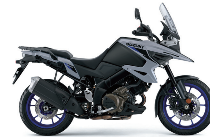
Glass Mat Mechanical Gray / Metallic Mat Black No.2 (CQX)