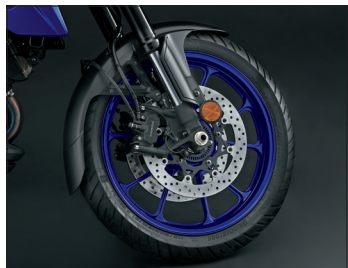
19-inch Cast Aluminium Front Wheel