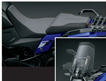
Variable Height Seat and Screen