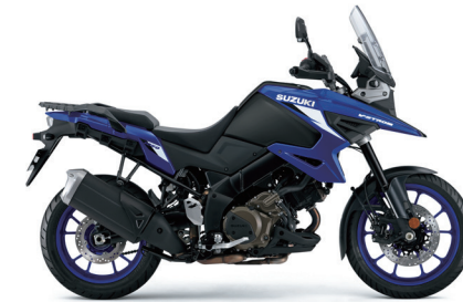
Pearl Vigor Blue / Metallic Mat Black No.2 (CGJ)