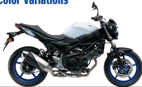
Pearl Glacier White (YWW)