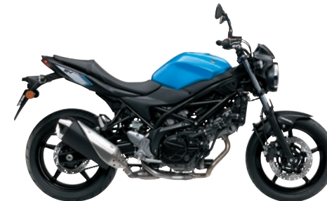
Metallic Triton Blue (YSF)