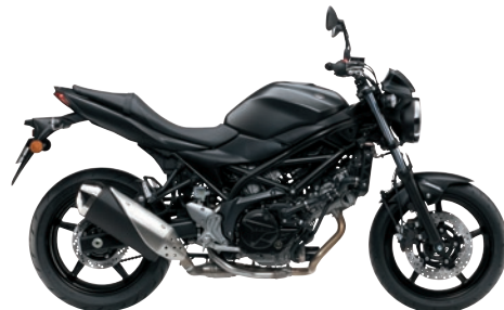
Metallic Mat Black No.2 (YKV)