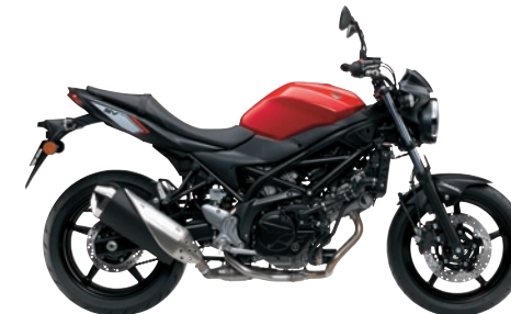
Pearl Mira Red (YVZ)